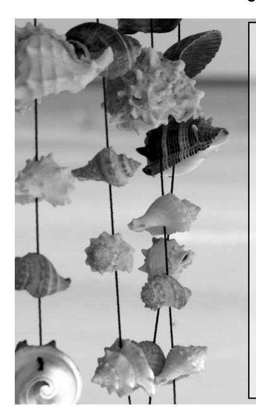
Fig. 4 for Question 4

Tourism in Barbados The 2014 Barbados Arts and Crafts Experience aims to increase visitor numbers to the island. What better way to introduce tourists to Barbados than to give them the chance to meet local craftworkers and the opportunity to make and take home a souvenir crafted from materials such as shells and driftwood? This makes a visitor's stay more memorable. The local craftworkers benefit from tourism spending and this helps the economy as a whole. Ecotourists are attracted by this. The Pelican Craft Centre in Bridgetown is the main centre for the Arts and Crafts Experience and the ticket price includes not only transport to the Pelican Craft Centre from many hotels on the island, but also lunch as well as instruction and craft materials at the Centre. The Barbados Arts and Crafts Experience is a great attraction for many tourists.